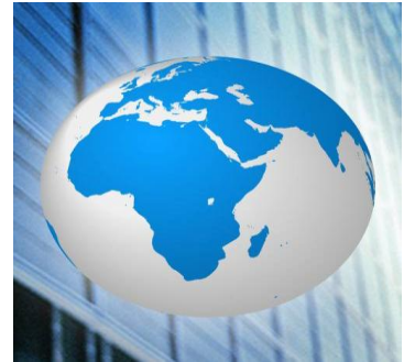
Increased Global Presence