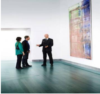
Higher Degree of Specialization