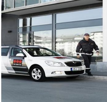
Expansion of Mobile and Monitoring